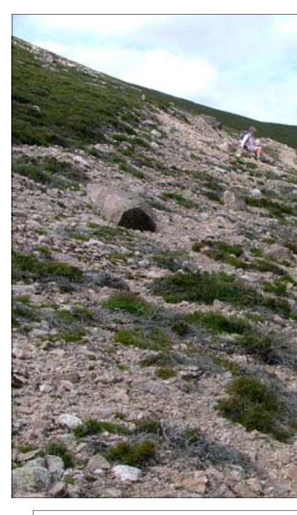
The National Trust for Scotland tracks on its Mar Lodge Estate, altitudes takes years, as shown high on the shoulder of Bein Ab